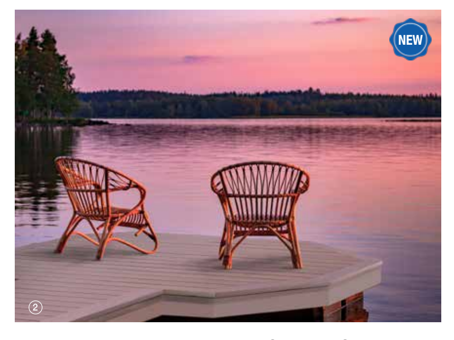
1 Gray Deck 2 Desert Brown Dock

Inteplast Dock features the capability to span 24" and is reversible with Teak and Cedar woodgrain finishes. Offering unmatched performance, exceptional durability, and the advantage of being lighter weight than composites. Its resistance to moisture and superior color retention makes it ideal for rainy and coastal areas as well as regions that experience more sun.